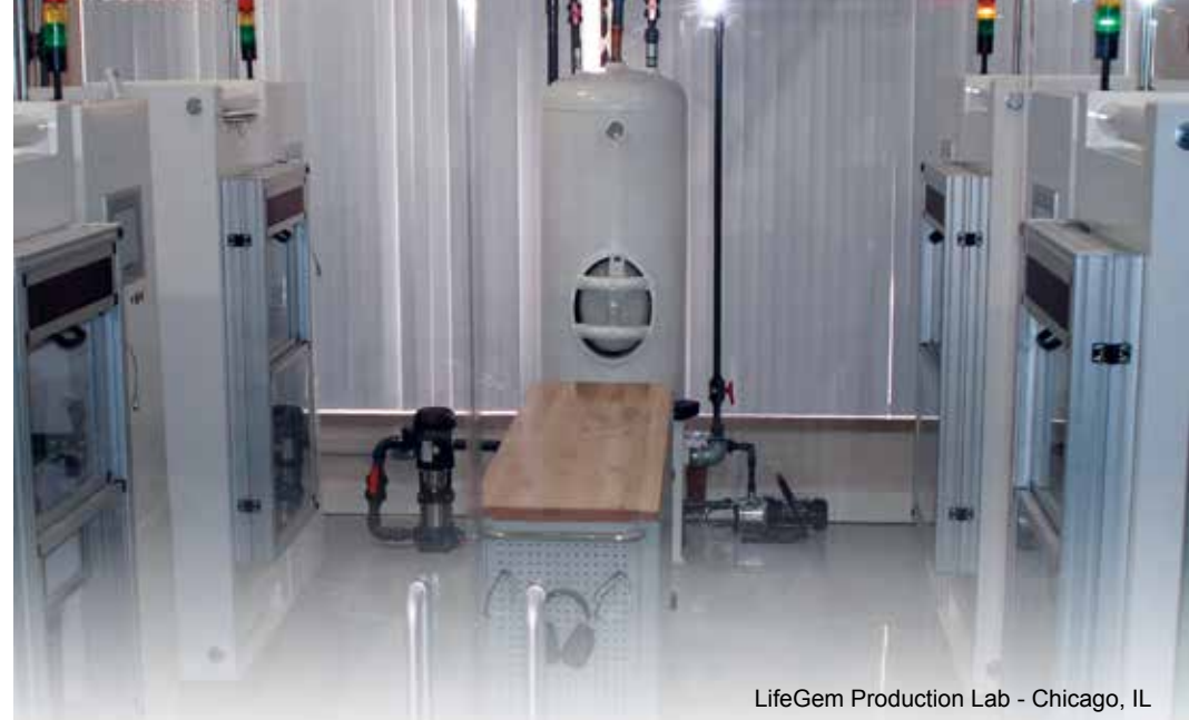
LifeGem Production Lab - Chicago, IL

Finally, skilled diamond cutters polish and facet each LifeGem diamond, laser etch the unique identifier on the girdle, and certify it for authenticity. All LifeGem diamonds are individually inspected and graded by gemologists trained by the Gemological Institute of America (GIA).